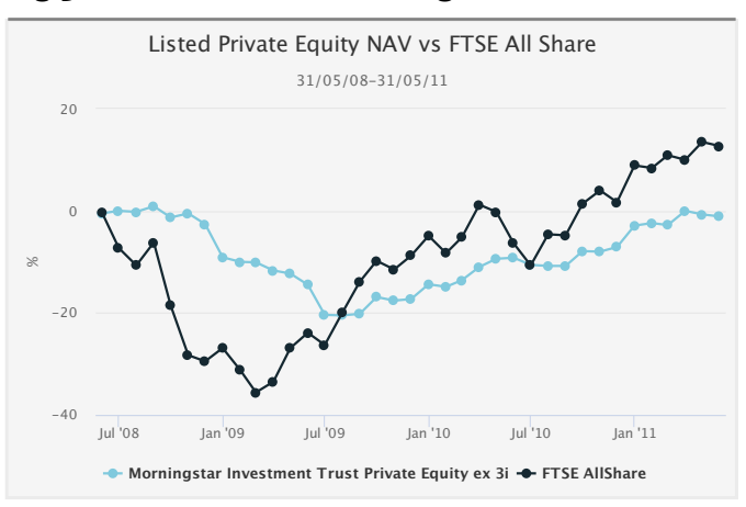
Fig.3: LPE NAV Returns Through The GFC

price and should be based on what is known and knowable at the measurement date: hence why we think end-June valuations will be much more interesting than end-March. The crux of the advice is that "care should be taken not to 'double-dip' with respect to valuation inputs". The IPEV is making the observation that comparable public market valuation multiples have come down significantly, because earnings estimates of the future have not necessarily come down, or are at least unknowable. If private equity valuations do reflect significantly lower earnings expectations, then multiples do not necessarily have to fall as far as public market comparables.