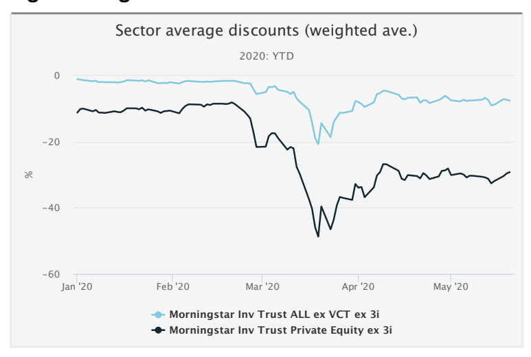
Fig.1: Average Discount YTD

At first glance, the listed private equity (LPE) sector has widened most of all, and remains on a significantly bigger discount than other sectors. Does this present an opportunity?